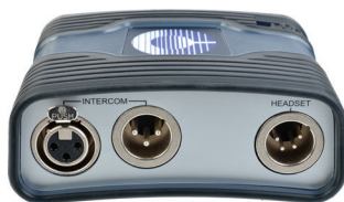
RS-701 Bottom View