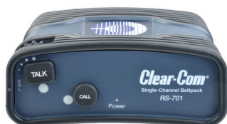
RS-701 Top View